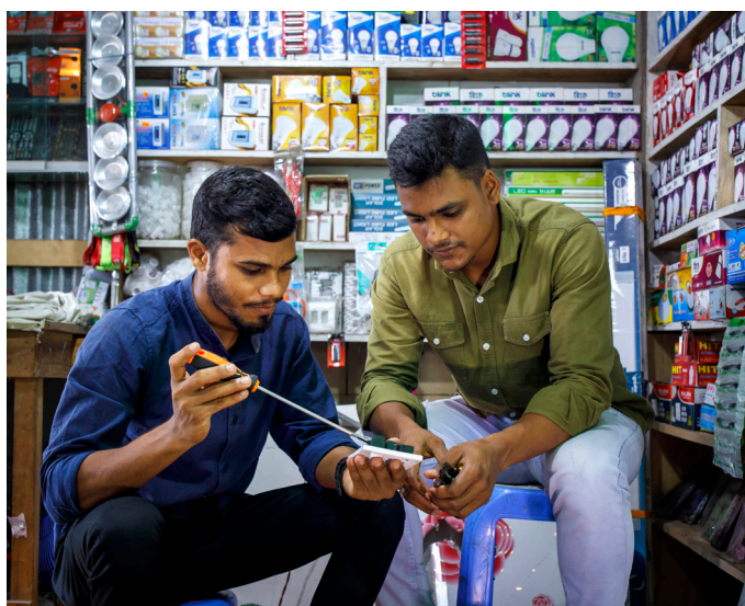
Learning new skills.